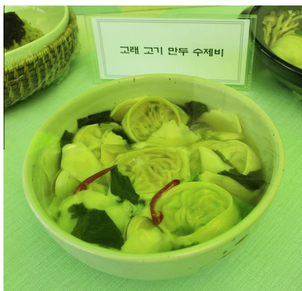
Fig. 4 A bowl of whale meat dumpling soup. This non-traditional dish was displayed at the Ulsan Whale Festival in 2012.

moratorium while also enjoying whale meat. The "safety of bycatch" claim functions as basic knowledge for many consumers of whale meat in Ulsan.