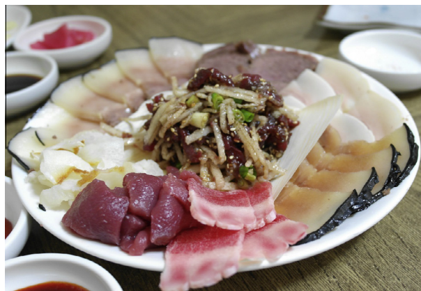
Fig. 2 A plate of whale meat as traditionally served by restaurants in Jangsaengpo, Ulsan. The meat is served raw or parboiled and accompanied by dipping sauces. The meats are not seasoned, except for the marinated raw meat served with pear slices in the center.

One important fact about whale meat in Ulsan is that many who eat it do not in fact oppose the moratorium. These consumers claim that eating whale meat is harmless, as long as the animal was not intentionally hunted but died through accidental entanglement. I refer to this as the “safety of bycatch” claim. Behind this claim is the belief that cetacean bycatch is not preventable, so using it as a source of food does not hurt whale populations nor bring harm to the environment. This stance allows a person to swear compliance with the